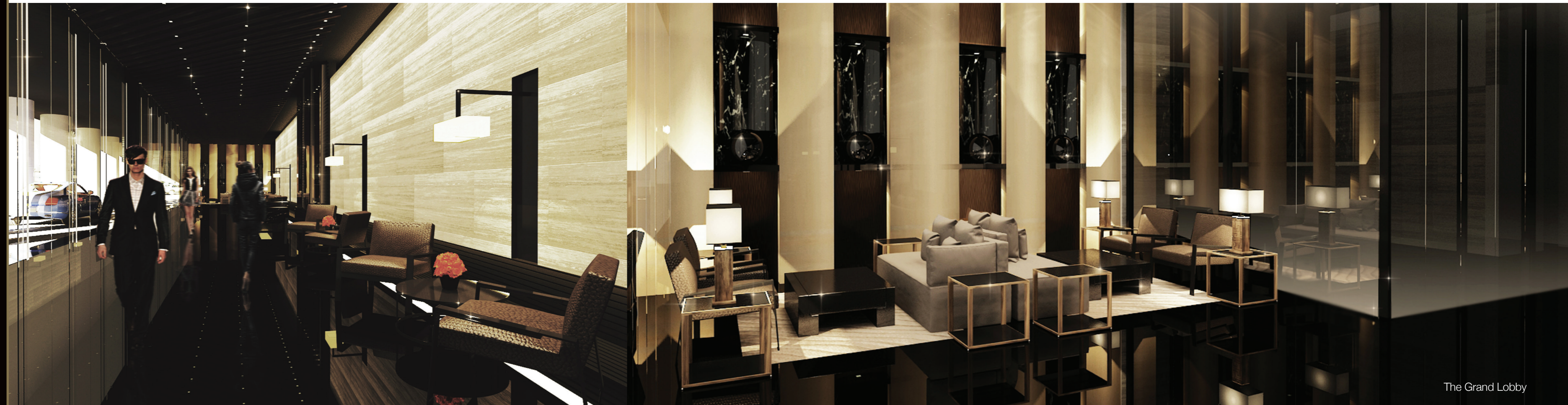
The Grand Lobby

Residents and guests are treated with chic and sophisticated ambiance to make that important first impression.