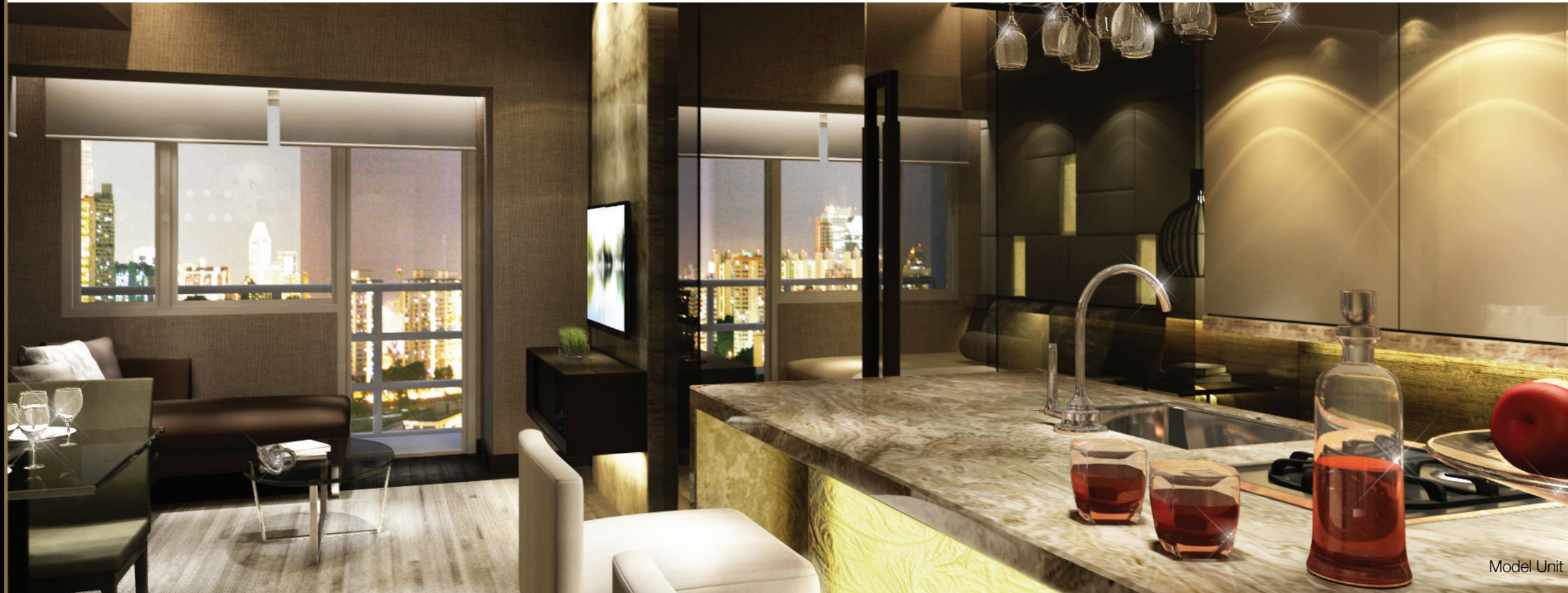
Upgraded perspective only and not the actual deliverable.